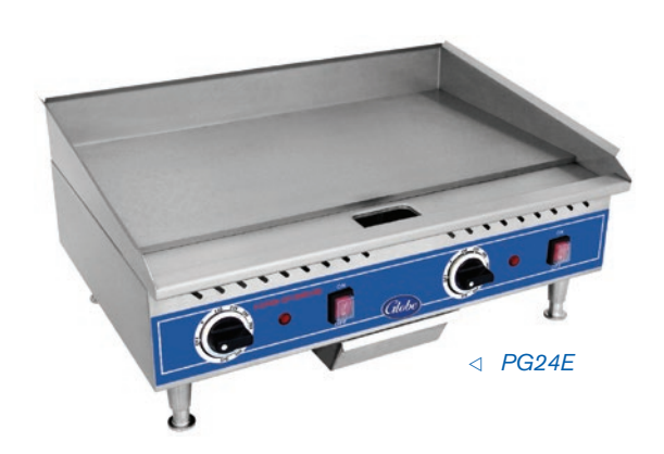
Use in the Front of House. Back of House, or both!