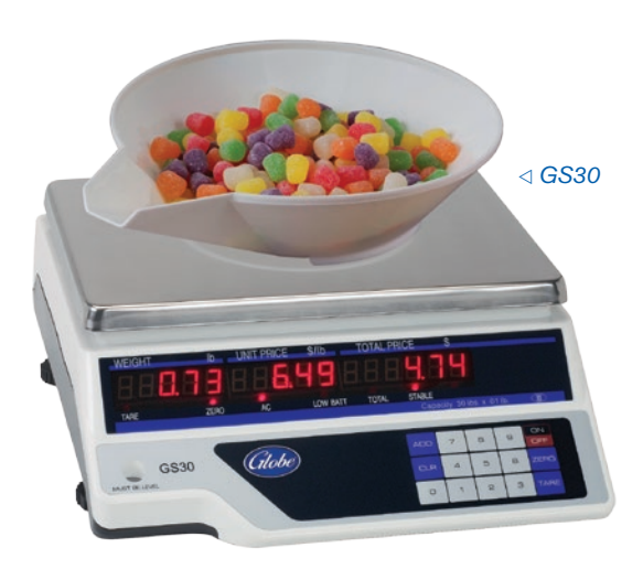
*Scoop sold separately for all scales

Accuracy and precision are the hallmarks of food preparation. The right scales help you do it efficiently. Whether you're portioning ingredients or ringing up the final creation, look to Globe for compact design, high visibility displays and keypads, and durable, easy-to clean surfaces.