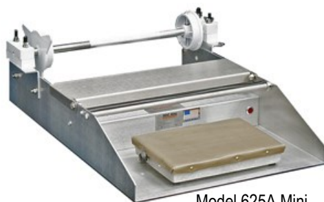
Model 625A Mini